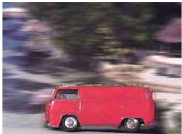
Model car in front of a moving background.