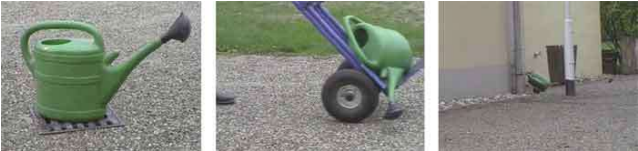
Stills from an experimental „Watering Can Production“