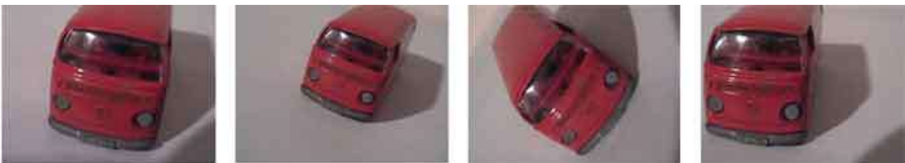
Rocking and rolling camera „Chase Scene Aesthetics“

A further possibility is to have the camera roll hectically from side to side, thereby achieving an effect similar to the shots in chase scenes when the horizon seems to rock and sway, the purpose being to create a more dynamic scene.